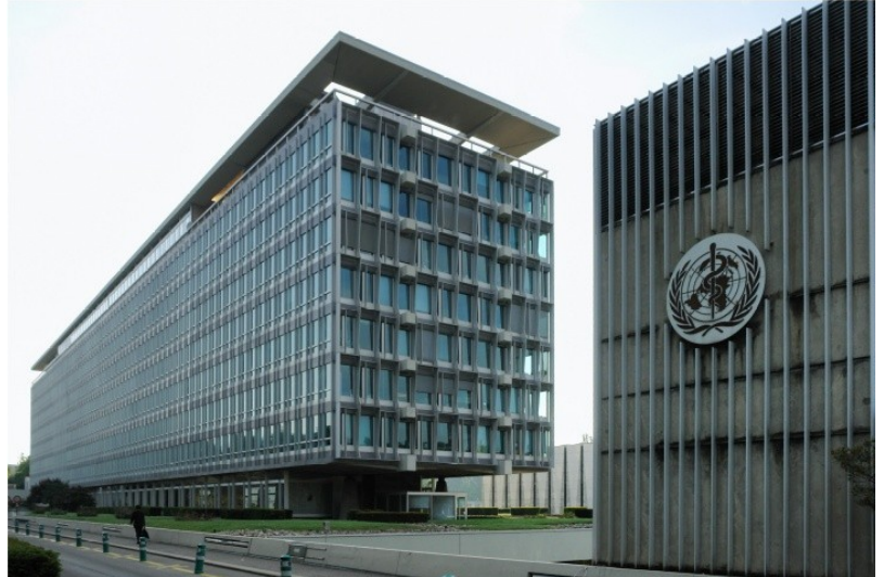
WHO headquarters in Geneva, Switzerland

Under the leadership of a Communist Chinese-backed “former” Marxist terror leader, the UN World Health Organization (WHO) and the Biden administration are plotting an unprecedented power grab to build a planetary bio-medical police state. Think Shanghai during lockdown, but worldwide. Leading experts argue that this is truly the emergence of the “New World Order” discussed by Biden and others.