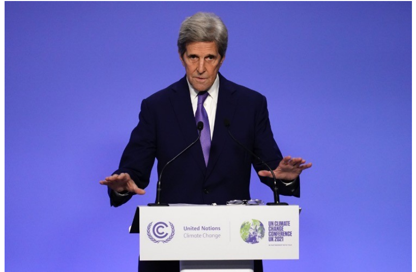
John Kerry speaking at COP26

Not surprisingly, shortly after the summit concluded, the New York Times revealed that Hunter Biden, the president’s son, played a key role in handing Beijing one of the world’s biggest cobalt mines. Cobalt is a key mineral involved in “green” schemes. It was not immediately clear how much the “Big Guy” might have received from the deal.