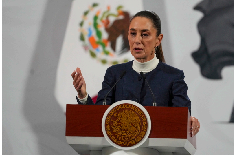
Claudia Sheinbaum

In a showdown last week, Petro cried uncle when he tried to refuse the return of deported Colombian illegal aliens.