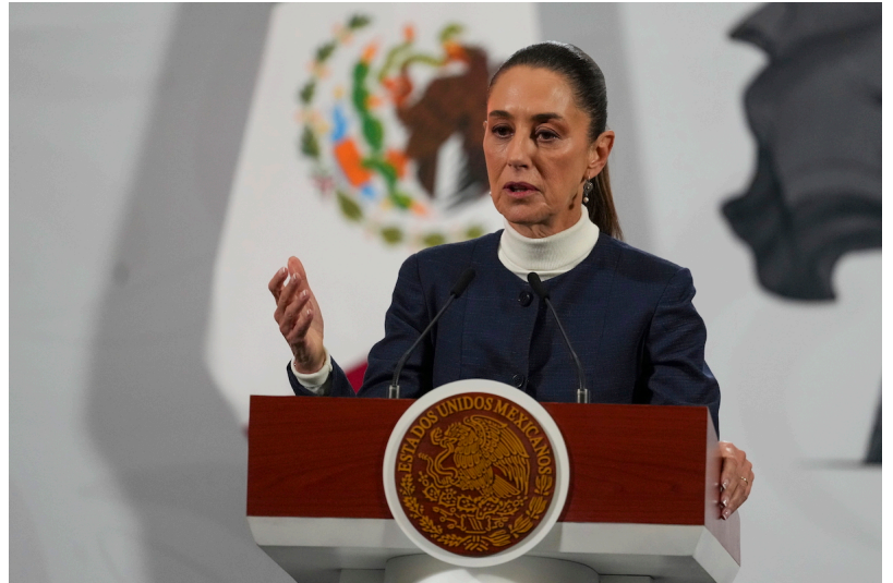
Claudia Sheinbaum

In a showdown last week, Petro cried uncle when he tried to refuse the return of deported Colombian illegal aliens.