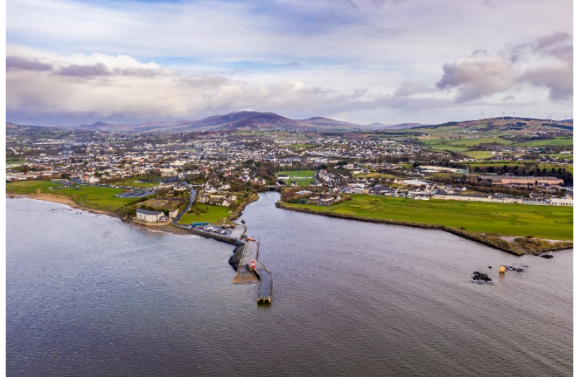
Buncrana, Ireland

The place is a small Irish town named Buncrana, which had already received migrants, such as Syrians in 2019 , without notice. In Buncrana, which is in County Donegal, almost 30 percent of its 6,000 to 7,000 population is already now foreign-born; meanwhile, it's claimed that 600 of the town's young people under 25 have left the area, as its services and housing capacity are strained.