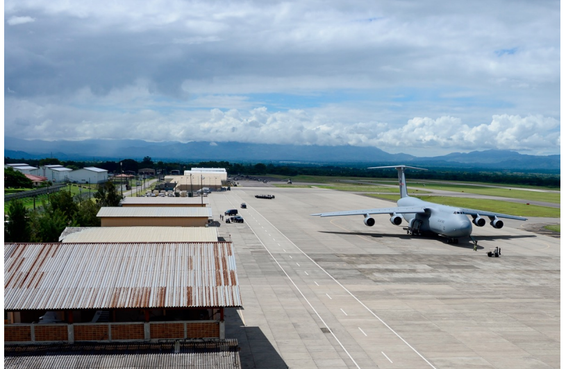
Soto Cano Air Base in Honduras

Mexico has prepared for legal war against the administration. It has created a smartphone application with which deportable illegals can notify consulates and subversive lawyers about their cases.