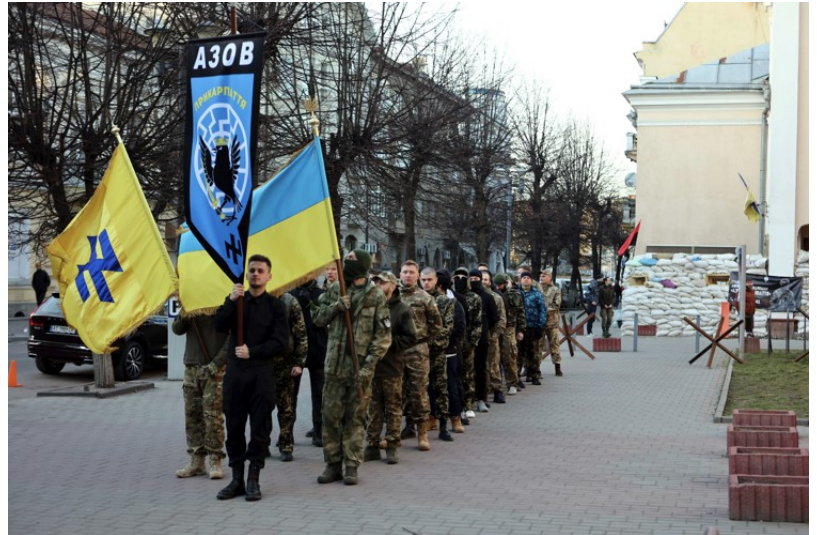
AZOV neo-Nazi soldiers in Ukraine

On April 7, the United Nations General Assembly voted by the required two-thirds of members voting to adopt a resolution calling for Russia to be suspended from the Human Rights Council. The ostensible cause for the move is the alleged Russian war crimes in Ukraine, including the claims of the atrocities allegedly committed by Russian troops against Ukrainian civilians in Bucha and elsewhere.