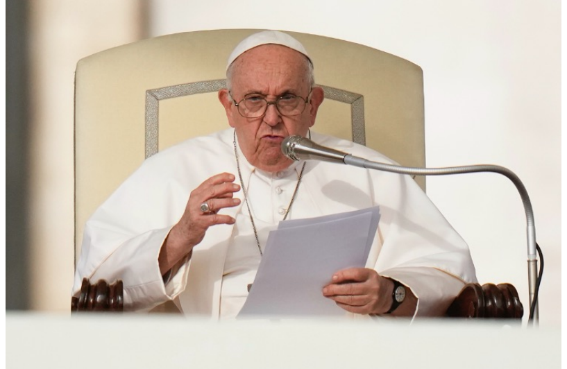
Pope Francis

Worldwide Catholic opposition to the Vatican's pre-Christmas declaration allowing blessings for same sex couples continues to escalate since the revolutionary papal document was issued. Fiducia Supplicans ("Supplicating Trust") was released on December 18, one week before Christmas, by the Dicastery for the Doctrine of the Faith (DDF) headed by the recently installed Cardinal Víctor Manuel "Tucho" Fernández of Argentina. Fernandez, a controversial and heterodox Jesuit, is a longtime friend, protégé, and advisor of Pope Francis, dating back to the pope's years as Archbishop Jorge Bergoglio in Buenos Aires. Fernandez's "liberal" views on sexuality stirred concerns as far back as 1995, when he became known as "the Kissing Priest" due to his authorship of the now-infamous erotic book, Heal Me With Your Mouth: The Art of Kissing .