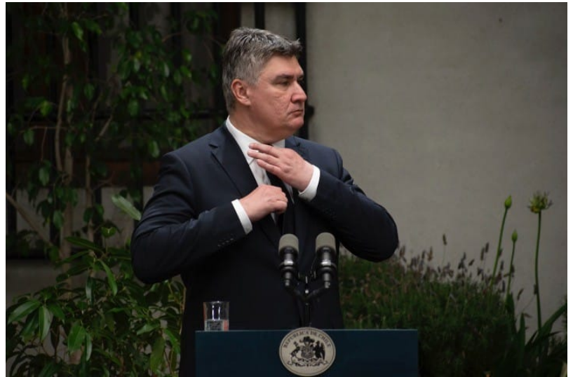
Zoran Milanovic

Novák took the opportunity of the joint event with her Croatian counterpart to urge the Ukrainian