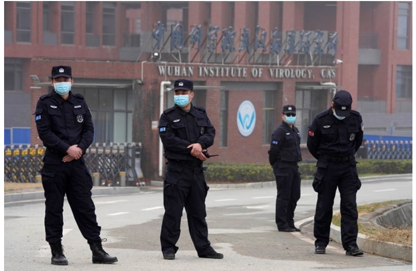
Security personnel gather near the entrance of the Wuhan Institute of Virology