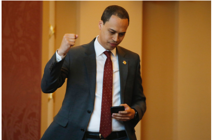
AP Images Jay Jones