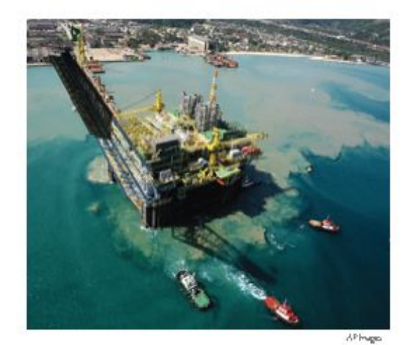
United States oil lock: Brazil's Petrobas Oil tows an oil

Today, of course, who wouldn't welcome $3.19 per gallon for regular/unleaded gasoline?