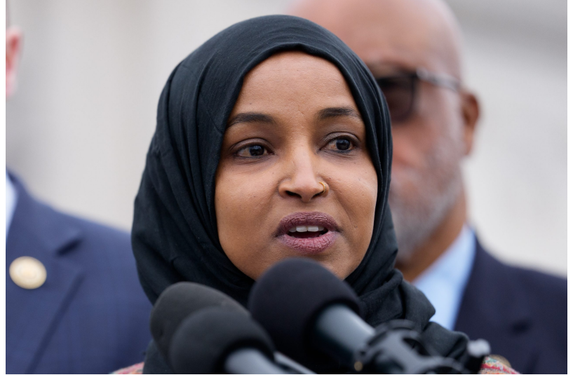
Ilhan Omar