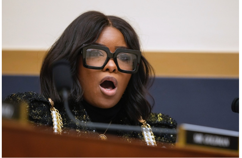
Jasmine Crockett

The Washington Free Beacon disclosed the possible violation today. Crockett “owned stocks in at least 25 companies that she did not disclose to the public during her first congressional run in 2022, even though she’d quietly admitted to the holdings the previous year as a Texas state legislator,” the website reported. Nor did she disclose the holdings when she landed in Congress in 2023.