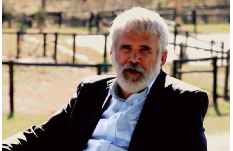
Dr. Robert Malone

Malone announced the suspension on Substack, although his Twitter followers likely knew before then that the anti-free speech outfit had deep-sixed his account.