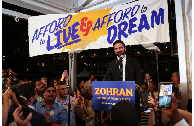
Zohran Mamdani

The victory means Mamdani will almost certainly become the next mayor.