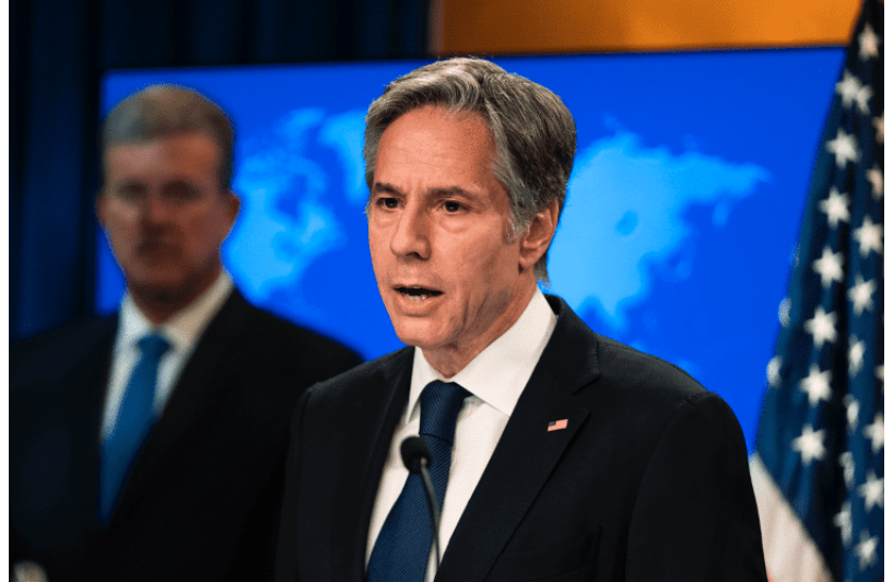
Secretary of State Antony Blinken

“As the President has repeatedly made clear, great nations such as ours do not hide from our shortcomings; they acknowledge them openly and strive to improve with transparency. In so doing, we not only work to set the standard for national responses to these challenges, we also strengthen our democracy, and give new hope and motivation to human rights defenders across the globe,” Blinken continued.