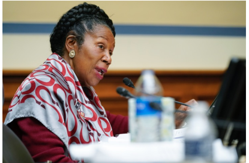
Sheila Jackson Lee

Similar trends were observed in Pennsylvania and Wisconsin, where President Biden secured narrow victories in 2020. In Pennsylvania, where Biden's margin of victory was 80,000 votes, the report estimated that a Reparations Commission could garner an additional 55,000 Black votes in 2024. Likewise, in Wisconsin, where Biden won by 20,000