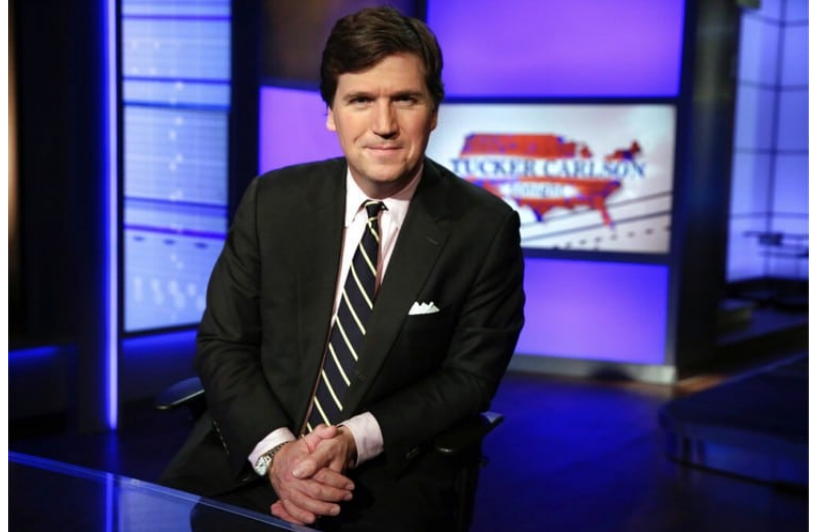
Tucker Carlson

Though NSA has denied the eavesdropping, it has not denied viewing his emails. The agency might have picked up his communications inadvertently by eavesdropping on someone else, but then “unmasked” the Fox commentator to reveal his identity.