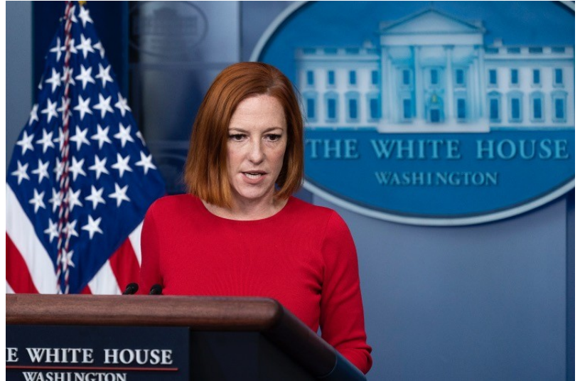
Jen Psaki

Read that again. According to Politifact — the left-leaning “fact-checking” website which usually bends truth to the breaking point to promote liberal claims — Jen Psaki is officially a liar. This is particularly interesting given that PolitiFact has been seen time and again to ignore truth while (1) making false claims about conservatives, and (2) decrying as “false” negative claims about liberals that turned out to be obviously true.