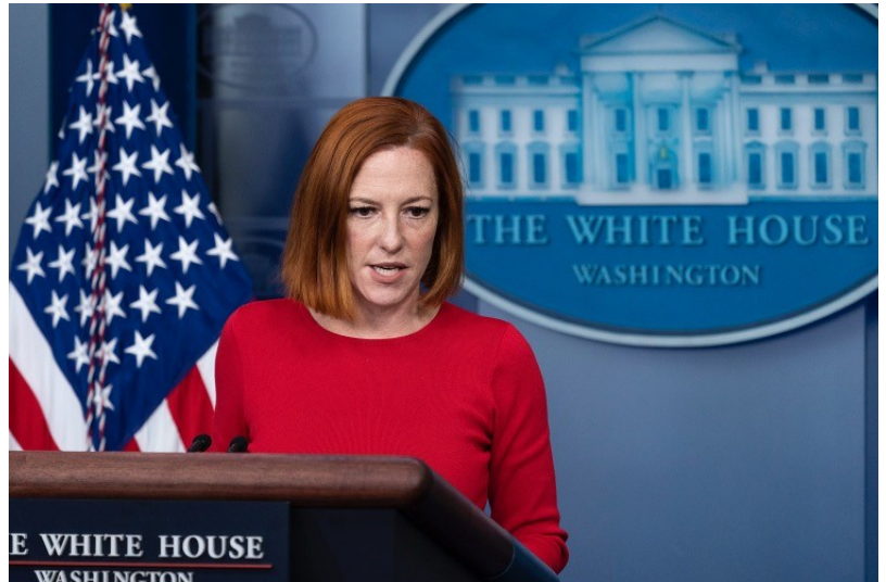
Jen Psaki

Read that again. According to Politifact — the left-leaning “fact-checking” website which usually bends truth to the breaking point to promote liberal claims — Jen Psaki is officially a liar. This is particularly interesting given that PolitiFact has been seen time and again to ignore truth while (1) making false claims about conservatives, and (2) decrying as “false” negative claims about liberals that turned out to be obviously true.