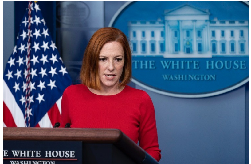
Jen Psaki

Read that again. According to Politifact — the left-leaning “fact-checking” website which usually bends truth to the breaking point to promote liberal claims — Jen Psaki is officially a liar. This is particularly interesting given that PolitiFact has been seen time and again to ignore truth while (1) making false claims about conservatives, and (2) decrying as “false” negative claims about liberals that turned out to be obviously true.