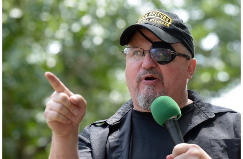
AP Images Stewart Rhodes

Team Biden is systematically destroying due process and shredding the rule of law. They are methodically demolishing the constitutional guardrails that were crafted to protect all Americans from the tyranny of omnipotent government. The Departments of Justice and Homeland Security and the FBI have been thoroughly corrupted (at least at the higher levels) and transformed into instruments of terror to be unleashed against the regime's political opponents. That means you, me, and millions of liberty-minded fellow citizens.