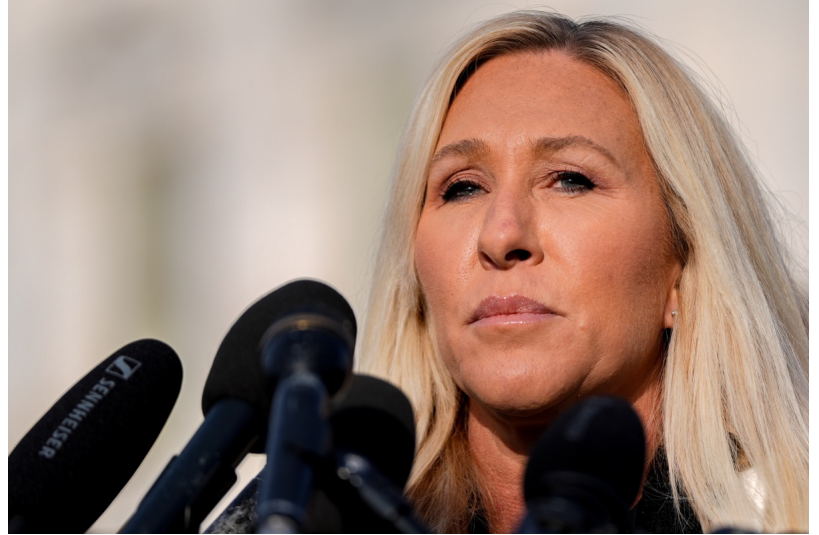
Marjorie Taylor Greene

But that isn't the only reason, she said last night in a video and written statement published on X at 8 p.m. President Donald Trump, whom she supported faithfully for years, turned on her. He withdrew his endorsement should she face a primary challenger, because she sided with Democrats to pass a bill releasing government files on deceased sex trafficker Jeffrey Epstein.