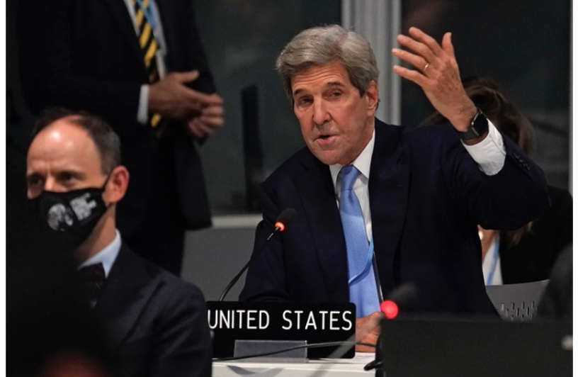
John Kerry

It really is a theme with the greentopians: Barack Obama said in 2008 that anyone who built a coal plant under his cap-and-trade plan would go bankrupt. Saule Omarova, Joe Biden’s Comptroller of the Currency nominee, stated in February that she wants to “bankrupt” the energy industry’s “small players.” Now White House “Climate Envoy” and ex-presidential candidate John Kerry has vowed to destroy tens of thousands of jobs. Specifically, while speaking this week at the COP26 climate summit in Glasgow, Scotland, Kerry said, “By 2030 in the United States, we will not have coal plants.”