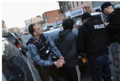
so one that we often hear reports of is ice pretending to be the local police.