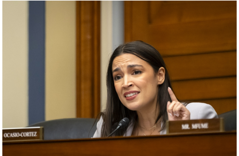
Alexandria Ocasio-Cortez

Explaining that its information is not legal advice, the webinar revealed such information as how, when, and where ICE conducts raids.