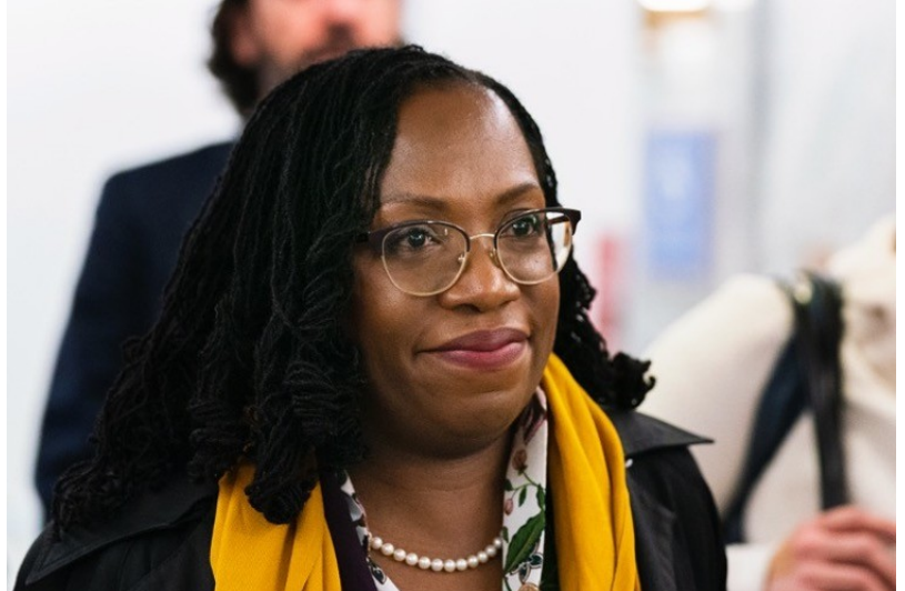
Ketanji Brown Jackson

Jackson, a soft-on-crime judge who favors leniency for perverts convicted of possessing child porn, will replace outgoing Associate Justice Stephen Breyer.