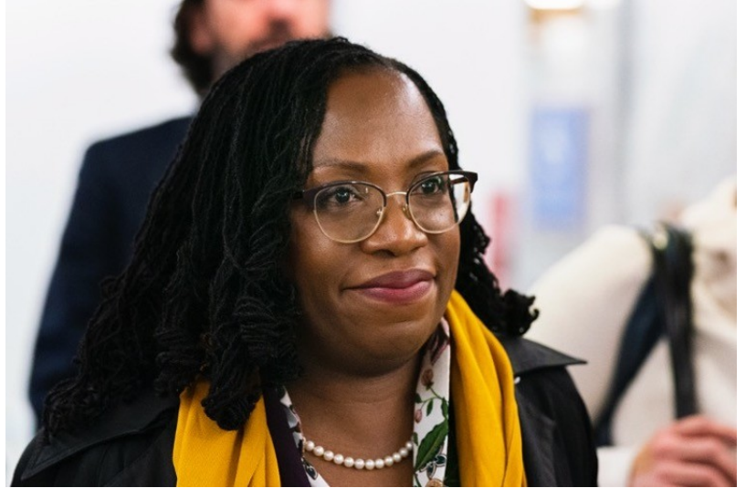
Ketanji Brown Jackson

Jackson, a soft-on-crime judge who favors leniency for perverts convicted of possessing child porn, will replace outgoing Associate Justice Stephen Breyer.