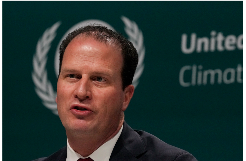
AP Images August Pfluger

However, the GOP congressmen also appeared to embrace some Democratic climate policies, and even the UN-backed government controls on carbon dioxide, a gas known to scientists as the “gas of life.” The Republicans also offered no resistance to the increasingly discredited hypothesis that human emissions of CO 2 represent “pollution” that is causing dangerous “climate change.”