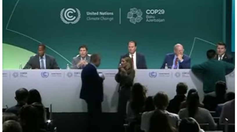
Republican congressmen at the UN COP29 Climate Summit in Azerbaijan tout CO2 reduction schemes.

However, the GOP congressmen also appeared to embrace some Democratic climate policies, and even the UN-backed government controls on carbon dioxide, a gas known to scientists as the "gas of life." The Republicans also offered no resistance to the increasingly discredited hypothesis that human emissions of CO 2 represent "pollution" that is causing dangerous "climate change."