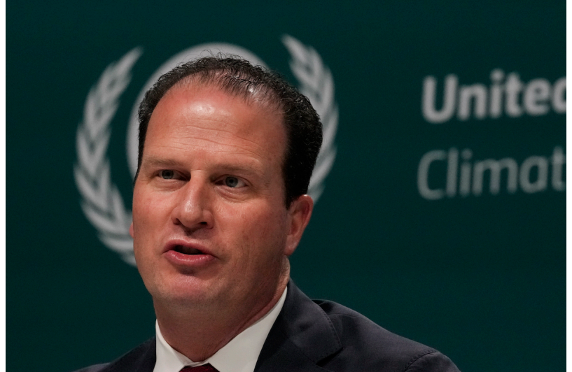
AP Images August Pfluger

However, the GOP congressmen also appeared to embrace some Democratic climate policies, and even the UN-backed government controls on carbon dioxide, a gas known to scientists as the “gas of life.” The Republicans also offered no resistance to the increasingly discredited hypothesis that human emissions of CO 2 represent “pollution” that is causing dangerous “climate change.”