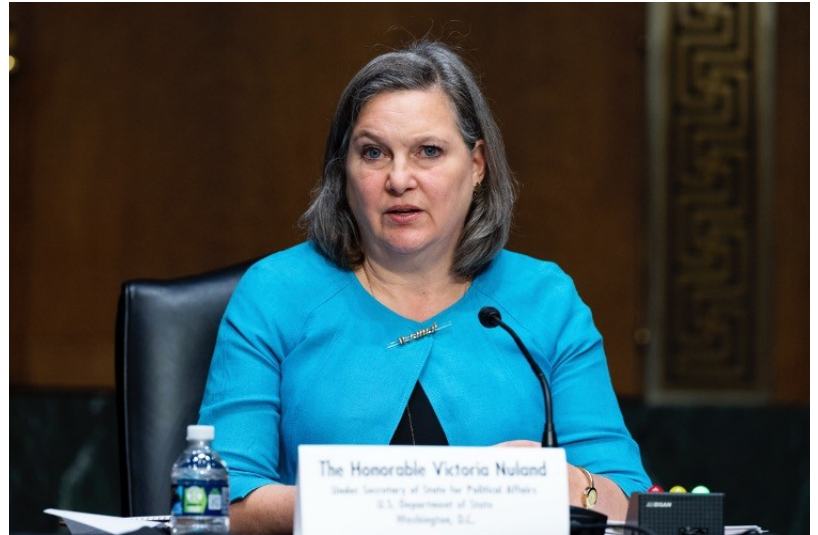
Victoria Nuland

On Tuesday, Russia's ambassador to the United States and its Foreign Ministry spokesman both said Russian troops had uncovered labs in Ukraine, a claim the State Department denied and called projection on Russia's part. Russia frequently accuses other countries of activities in which Russia is engaged.