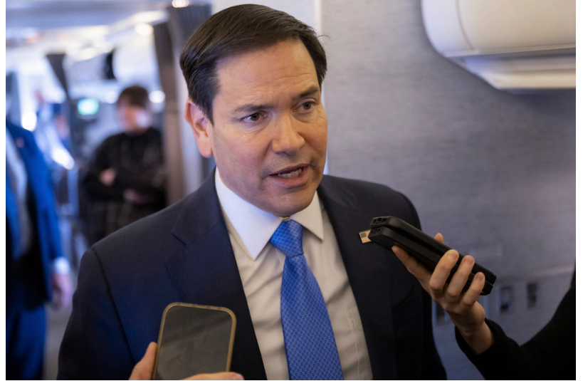
Marco Rubio

According to the conservative watchdog group Judicial Watch, the Trump administration’s State Department, led by Marco Rubio, is shielding USAID’s secrecy. This raises serious concerns over whether the funds have been diverted to terrorist-linked groups.