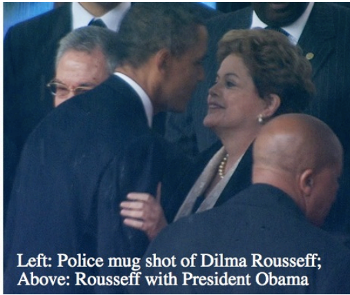
Left: Police mug shot of Dilma Rousseff; Above: Rousseff with President Obama

By embracing and kissing Rousseff at the memorial — an image that not only flashed around the planet but was used extensively by the pro-Rousseff media in Brazil — President Obama gave the impression that the most powerful nation in the world fully supports her pro-communist regime.