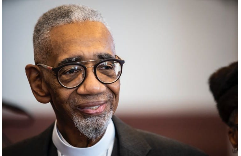
Bobby Rush

"After nearly three decades in Congress, I have been reassigned," Representative Rush tweeted on January 4. "While I will not be running for a 16th term, let me make it clear that I am not retiring — I am returning. I'm returning home, returning to my church, and returning to my family and grandchildren."