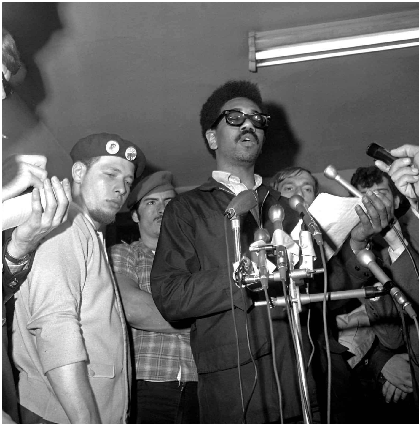
Bobby Rush in 1969

Many of the 1960s rioters and bomb-throwers went into education, becoming professors and taking over colleges and universities. Over the past couple of generations, they have successfully indoctrinated countless students in left-wing ideology, identity politics, and political correctness. Other radicals from the 1960s and '70s chose to channel "The Revolution" into spiritual and moral subversion by working through liberal-left churches, synagogues, and mosques to promote abortion, LGBTQ+ campaigns, open borders, illegal-alien amnesty, sanctuary cities, defunding/abolishing police, gun confiscation, global-warming hysteria, "green" energy policies, and various and sundry similar attacks on the foundations of society. Still others went into politics, either running for elected office themselves or serving as advisors to political front men, and trainers of the cadres that do the heavy lifting in political campaigns.