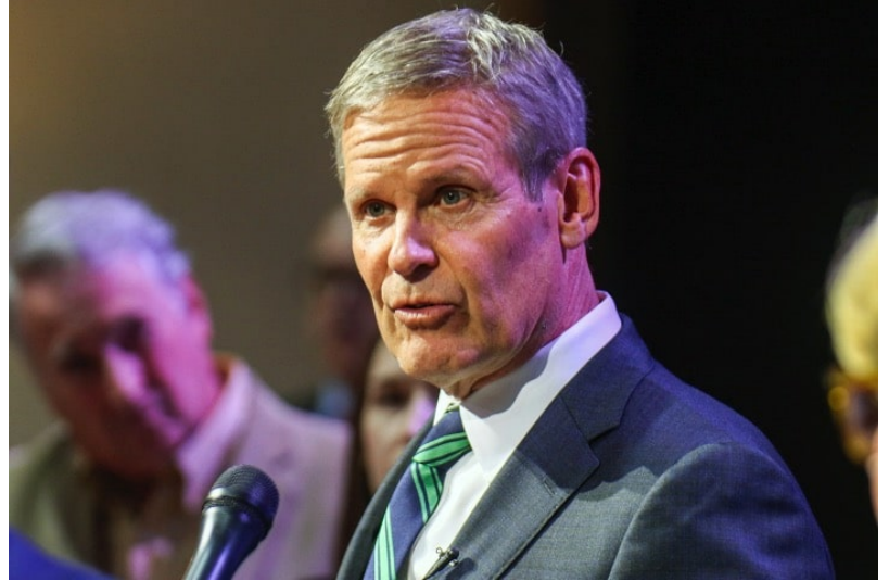
AP Images Bill Lee

The DOJ says the new law is unconstitutional, supposedly violating the 14th Amendment’s Equal Protection Clause. The agency is accusing Tennessee of discrimination, arguing that the bill denies access for those diagnosed with gender dysphoria to the same or similar procedures that non-transgender minors can obtain. DOJ is joining a lawsuit filed April 20 on behalf of a number of plaintiffs, filed by the American Civil Liberties Union and the radical leftist Lambda Legal Defense and Education Fund.