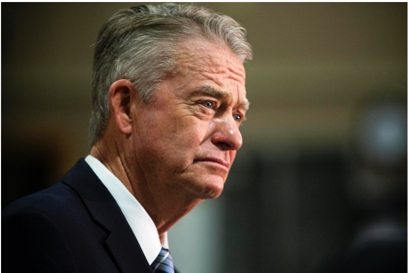
Brad Little

The Idaho "fetal heartbeat law" has an enforcement mechanism modeled after the recent (and already famous) Texas "fetal heartbeat law" that helped spur the Supreme Court into taking another look at Roe v. Wade. The new law goes into effect April 22 (30 days after becoming law) and allows relatives of a pre-born child to sue