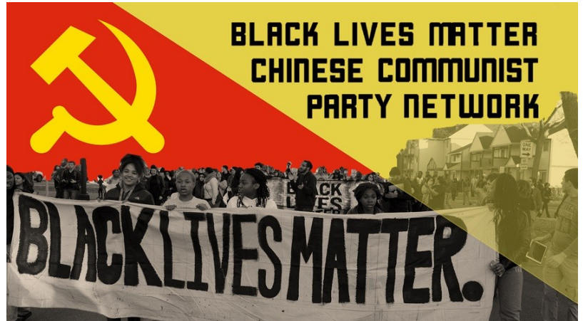
Primary image of BLM protest

BLM was founded in July 2013 by three young activists — Alicia Garza, Patrisse Cullors, and Opal Tometi. It has been known for some time that they are all Marxists. What has remained hidden until now are their close ties to CCP networks.