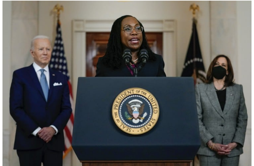
Judge Ketanji Brown Jackson

President Biden sought a candidate with exceptional credentials, unimpeachable character, and unwavering dedication to the rule of law.