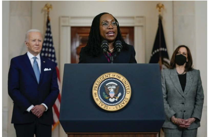
Judge Ketanji Brown Jackson

President Biden sought a candidate with exceptional credentials, unimpeachable character, and unwavering dedication to the rule of law.