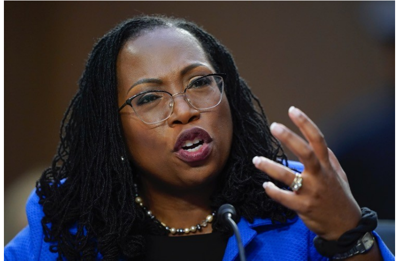
Ketanji Brown Jackson

During committee hearings Tuesday, Senator John Kennedy (R-La.) questioned D.C. Circuit Court of Appeals Judge Jackson about the Supreme Court's role in deciding rights and laws and asked her one of the most fundamental questions of constitutional jurisprudence.