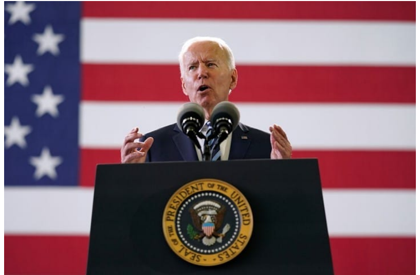
President Joe Biden speaks to American service members about a nationwide strategy to combat domestic terrorism

Domestic terrorist attacks in the United States also have been committed frequently by those opposing our government institutions. In 1995, in the largest single act of domestic terrorism in U.S. history, an anti-government violent extremist detonated a bomb at the Alfred P. Murrah Federal Building in Oklahoma City, killing 168 people — including 19 children — and injuring hundreds of others. In 2016, an anti-authority violent extremist ambushed, shot, and killed five police officers in Dallas. In 2017, a lone gunman wounded four people at a congressional baseball practice. And just months ago, on January 6, 2021,