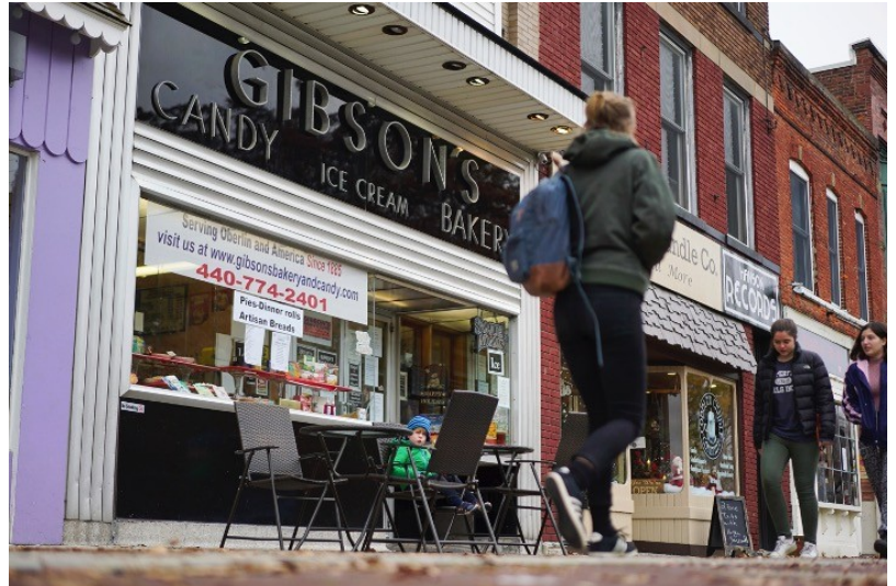
Gibson's Bakery, Oberlin, Ohio

Three black students entered the store (which also sells wine) on November 9, 2016, and the police recorded what happened next: