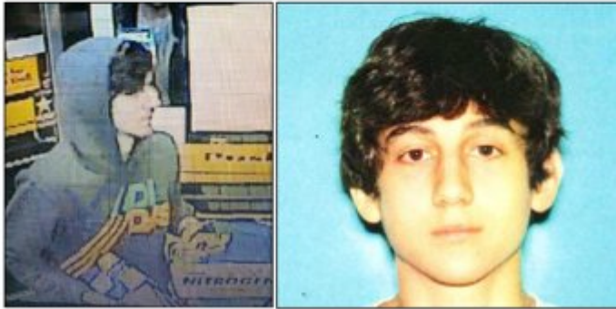
Dzhokhar A. TSARNAEV DOB: 7/22/1993 LKA: 410 Norfolk St. Apt #3, Cambridge, MA

Information Update: the above suspect in hood, a suspect in the Boston Marathon Bombing, has been identified by the FBI as the individual in the photo on the right, Dzhokhar TSARNAEV (DOB: 7/22/93).