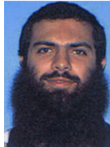
Photograph taken in 2002