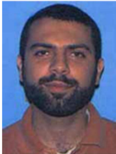
Photograph taken in 2004

Conspiracy to Provide Material Support to Terrorists; Providing and Attempting to Provide Material Support to Terrorists; Conspiracy to Kill in a Foreign Country; Conspiracy; False Statements