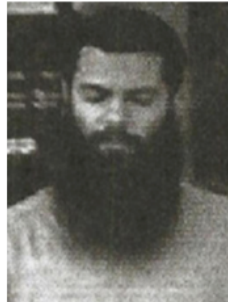
Photograph taken in 2002