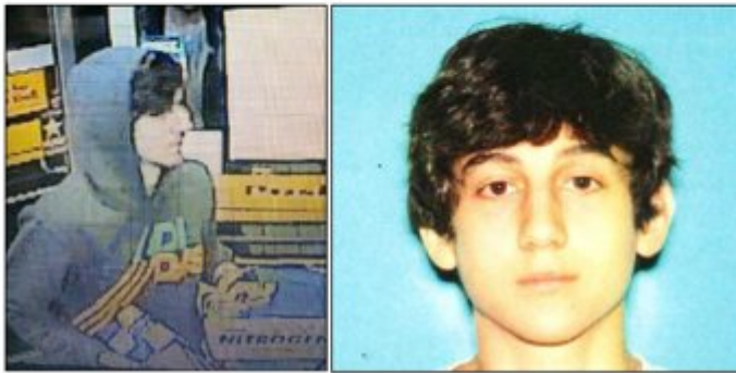
Dzhokhar A. TSARNAEV DOB: 7/22/1993 LKA: 410 Norfolk St. Apt #3, Cambridge, MA

Information Update: the above suspect in hood, a suspect in the Boston Marathon Bombing, has been identified by the FBI as the individual in the photo on the right, Dzhokhar TSARNAEV (DOB: 7/22/93).