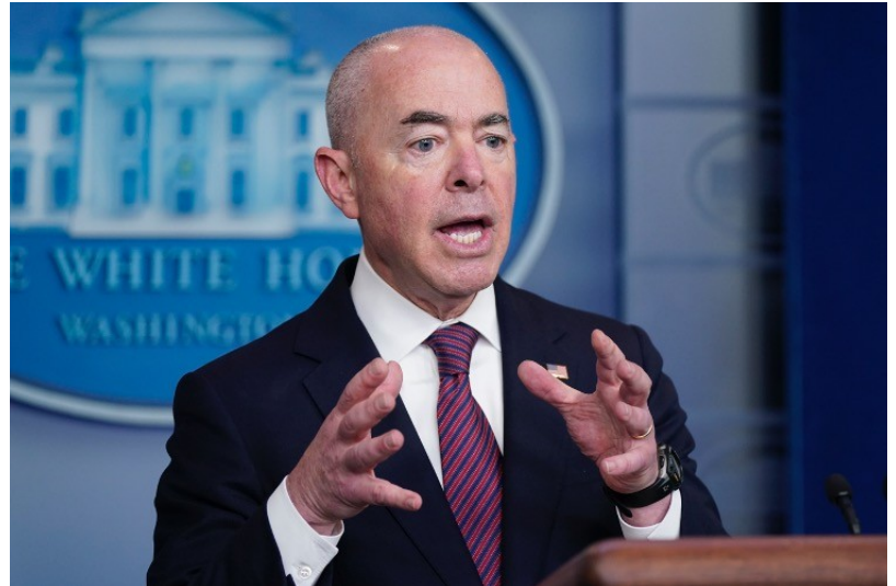
Alejandro Mayorkas

As the New York Post reported , that admission comes days after Mayorkas confessed that the Biden Regime didn't test any of the nearly 15,000 Haitians, quickly imported after the Big Whip Lie , for the