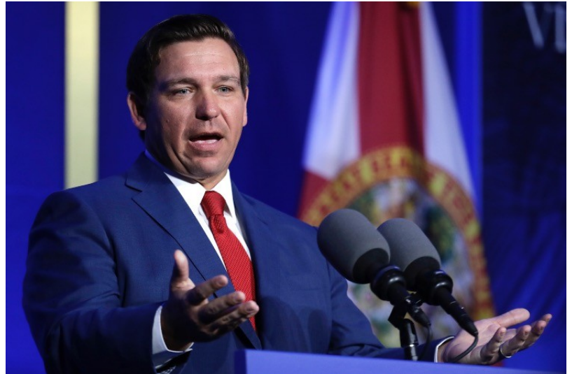
Ron DeSantis

Joe Biden's stance on immigration has differed drastically from Donald Trump's. The COVID-19 outbreak is now being used as grounds for carrying out attrition of U.S. border patrol.