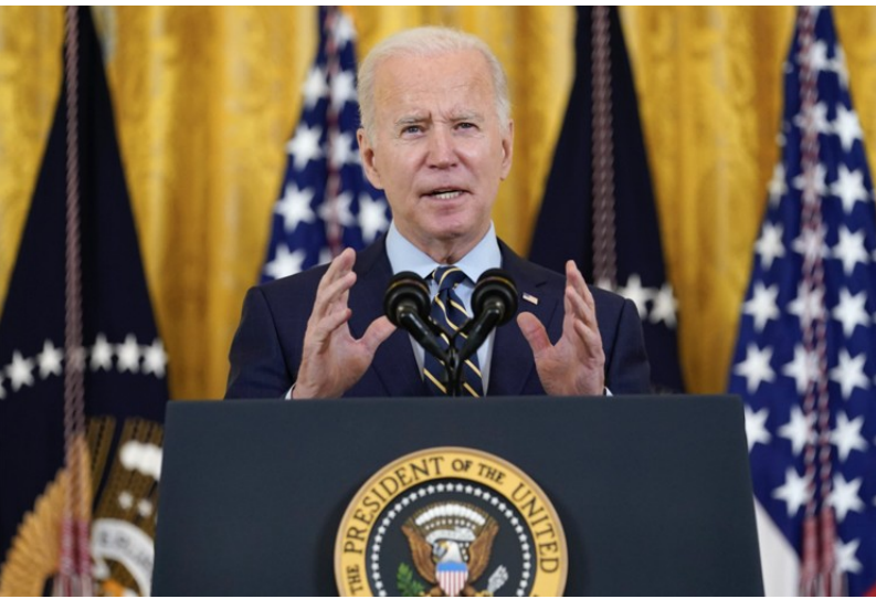
President Joe Biden

The shocking numbers <u>from the Center for</u> <u>Immigration Studies</u> are news. The treason is not. It's exactly what Traitor Joe and his leftist gang promised. The goal: Bring in new voters, cement Democrat Party control of the country, dispossess the American people.