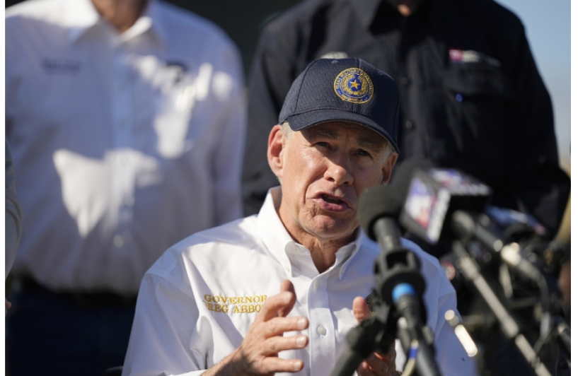
Greg Abbott

Message from Abbott to Sleepy Joe: You won't stop the invasion, so I will.