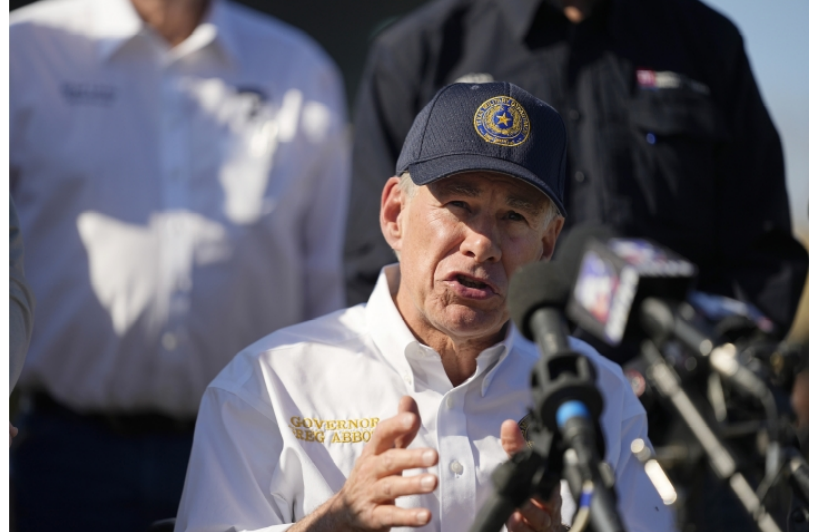
Greg Abbott

Message from Abbott to Sleepy Joe: You won't stop the invasion, so I will.