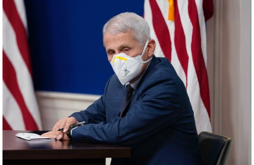
Anthony Fauci

Disclosed by Representatives James Comer of Kentucky and Jim Jordan of Ohio, the cybermissives also reveal something else: The two men were well aware that top scientists believed the SARS-CoV-2 pathogen leaked from the poorly run lab .