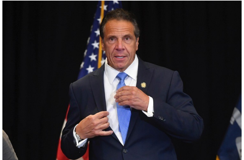
Andrew Cuomo

Cuomo praised the state’s COVID-19 vaccination app called Excelsior Pass — “easily present your Pass at participating businesses and become part of New York’s safe reopening,” advertises the app’s website. The app was launched in May as an electronic proof of one’s vaccinated status against