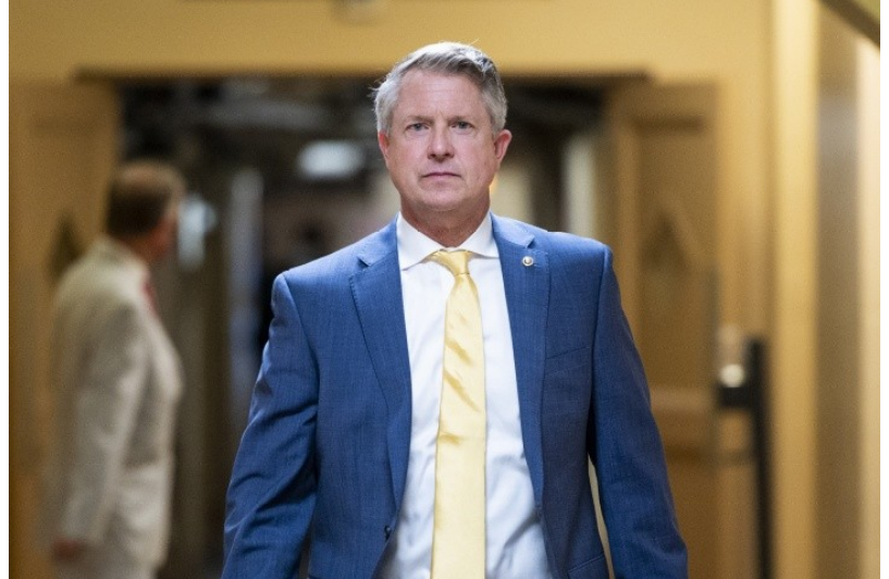
Roger Marshall

The resolution terminating the national emergency declared by the finding of the President on March 13, 2020 passed the Senate in a 48-47 vote. It was introduced by Senator Roger Marshall (R-Ky.) and was co-sponsored by Republican Senators Ron Johnson (Wis.), Ted Cruz (Texas), Rick Scott (Fla.), Rand Paul (Ky.), Mike Braun (Ind.), Mike Lee (Utah), and Steve Danes (Mont.).