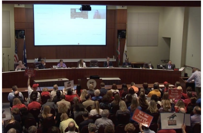
Loudoun County school-board meeting